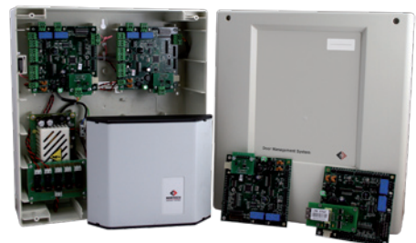
CRC220 Network Controller

The CRC220 supports TCP/IP or RS485 connectivity.